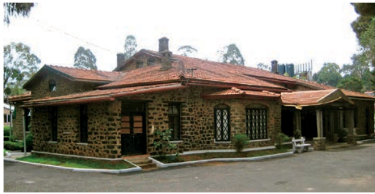
Renovated KMU, home of the KIS Archives & Museum